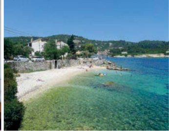
Gaios town beach