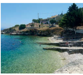
Beach below Margina

Gaios' harbour front starts just a 4-5 minute walk away (350m) after the small town beach, and the central square is 8-10 minutes' (700m) leisurely stroll along the quayside with a selection of cafes and restaurants to choose from along the way. Water-taxis for the whitesand beaches of Antipaxos run regularly from here. Please note there are some steps up to Margina from the road and within the hotel (no lift).